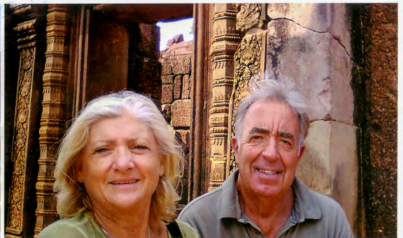
Lagoon owners enjoying a visit to Angkor Wat